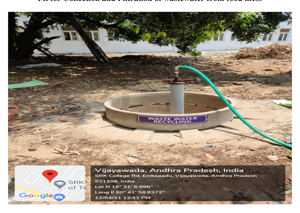
Filtered water collected into a Bore well and lifted using 1 HP Pump